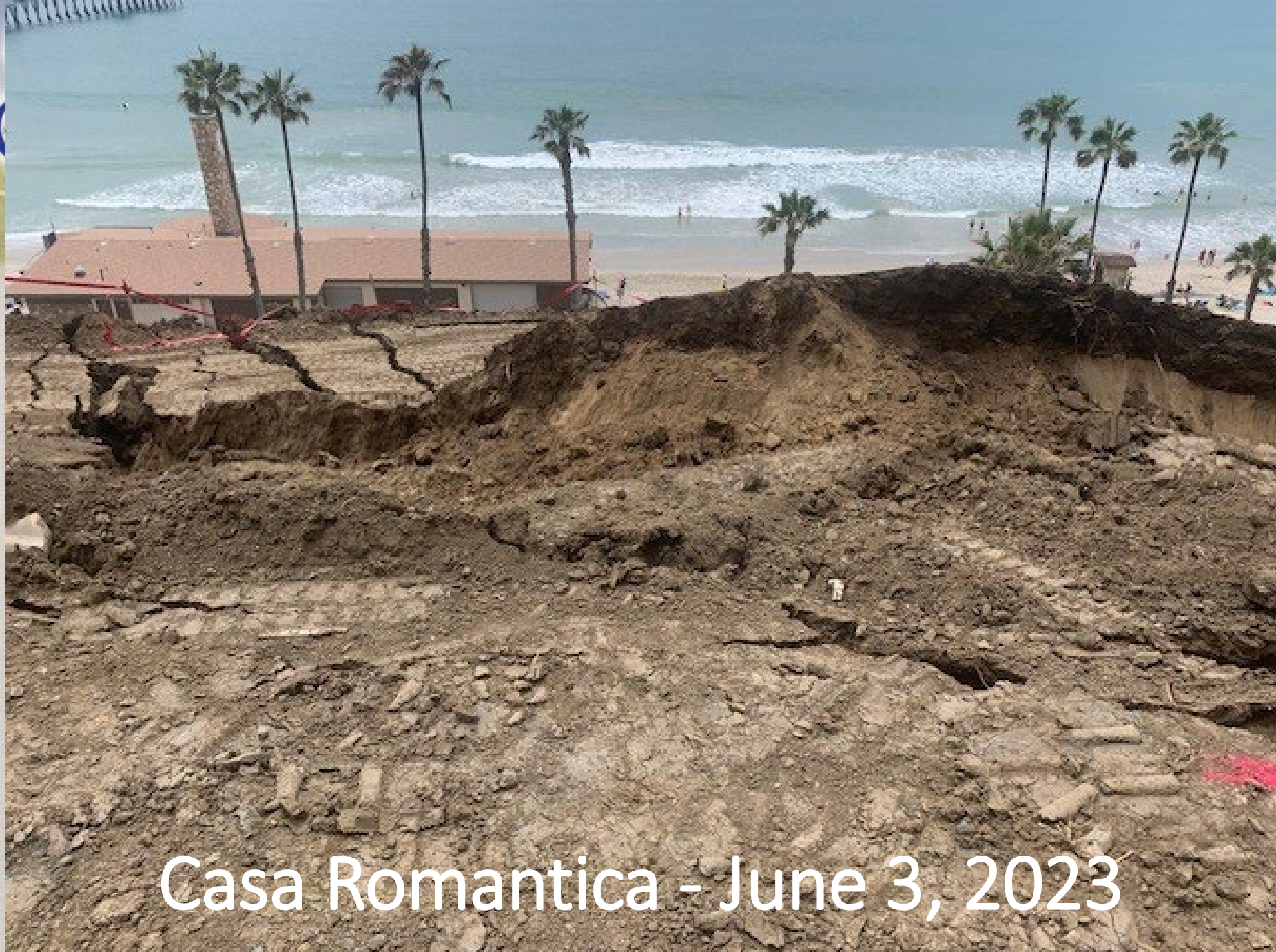
Casa Romantica - June 3, 2023