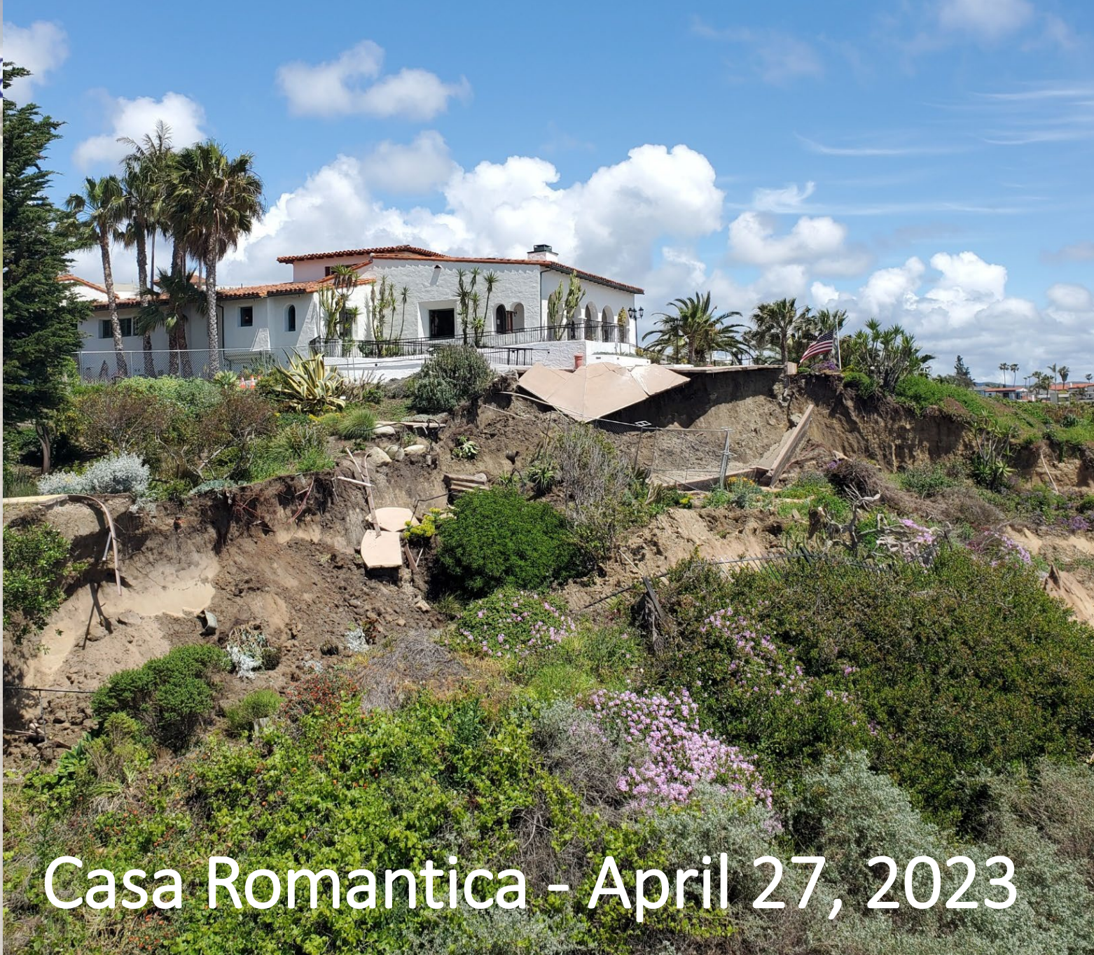
Casa Romantica - April 27, 2023