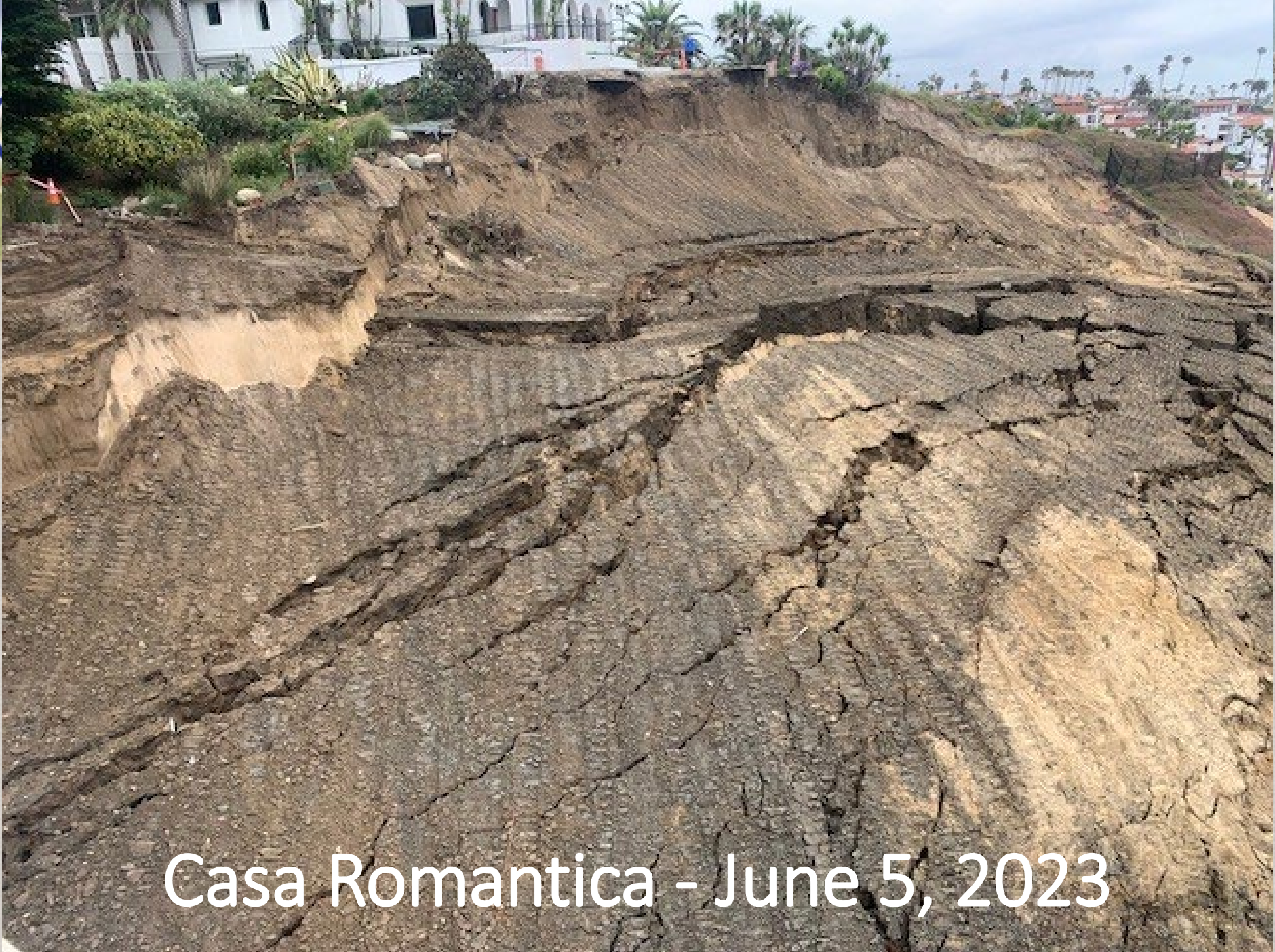
Casa Romantica - June 5, 2023